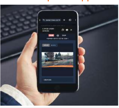
Hazard information Picture & Location