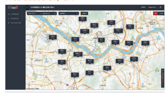
Timely hazard information of roads / designated area