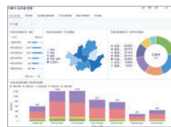
Graph based statistics and visualization