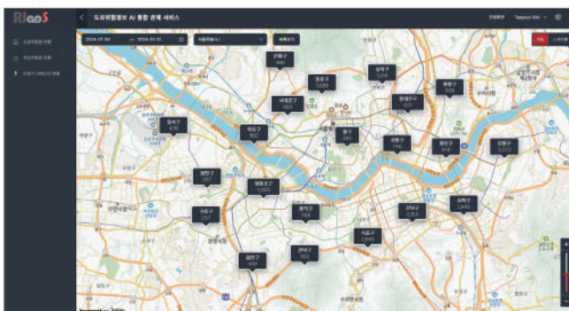
Timely hazard information of roads / designated area