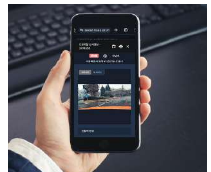
Hazard information Picture & Location